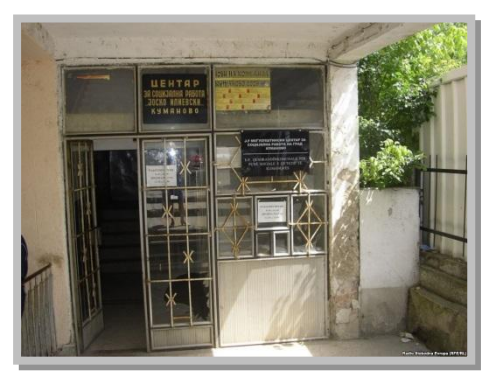
JU Inter-municipal Center for Social Work

The Inter-municipal Center for Social Work deals with rights and services. It covers social protection needs of the population from several municipalities. Offered services may be individual or group, depending on the needs of the beneficiaries. These services are provided to families having family or marriage related problems, old and exhausted persons, children under risk, children with behavioral and social problems, and children with developmental difficulties.