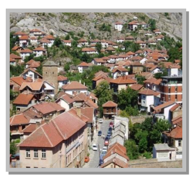
Municipality of Kratovo

The Municipality of Kratovo is located in the Northeastern Region and has, according to the most recent population census, a total of 10,441 inhabitants. The town of Kratovo is central to the municipality, which also includes 30 villages. Kratovo has the following institutions: Museum of Kratovo, Home of Culture and Town Library.