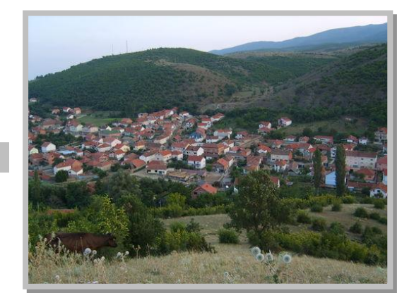
Municipality of Lipkovo