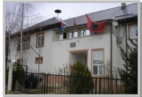
Premises of the local selfgovernment - Lipkovo