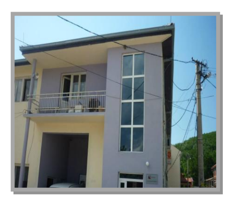
Premises of the local self- 20 government in Rankovce